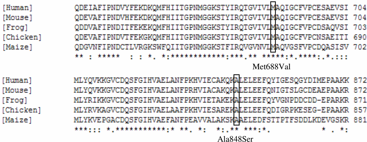
Figure 2 Phylogeny of the MSH2 Met688Val and Ala848Ser variants. Multiple sequence alignment of the hMSH2 polypeptide sequence and orthologues from other species were generated using the ClustalW algorithm [31]. The following polypeptide sequences were used in the alignment: P43246 (Human; Homo sapiens ), CAA57049 (Mouse; Mus musculus ), S53609 (Frog; Xenopus laevis ), XP 426110 (Chicken; Gallus gallus ) and CAB42554 (Maize; Zea mays ).

frequencies of a large number of hMLH1 and hMSH2 variants and their association with sporadic CRC have never been analyzed in a large well defined Caucasian population. A previously published case-control study have dem-